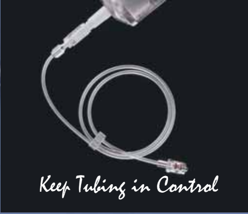
1200 PSI (83 Bar) Braided Tubing