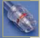
Pressure Monitoring Tubing