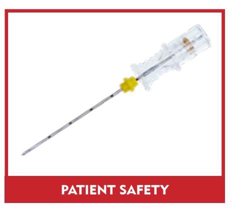
Valved Coaxial Introducer Intended to minimize the risk of air entering the pleural space and fluid leakage?

Total Core <sup>--</sup> Biopsy Technology Average 72% larger than competitor side-notch, semi-automatic devices!