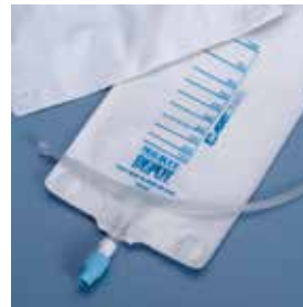
Merit Drainage Depot™ Drainage Bag