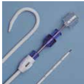
ReSolve® Non-Locking Drainage Catheter