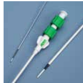
MAK-NV™ Introducer System