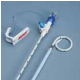
ReSolve® Locking Drainage Catheter