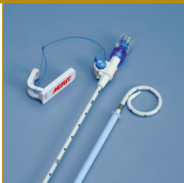
ReSolve® Drainage Catheters