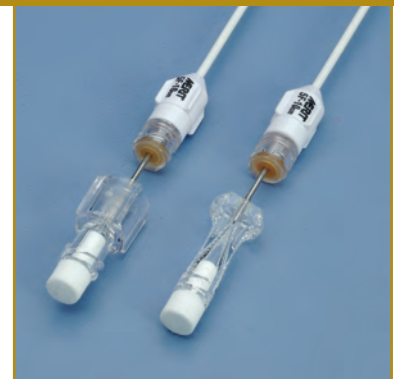
One-Step™ Centesis Catheters