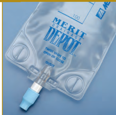
MDD600 Drainage Bag