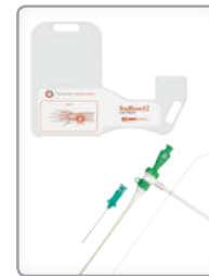
SET-UP & ACCESS