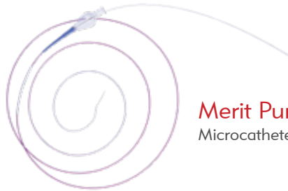
Merit Pursue™ Microcatheter