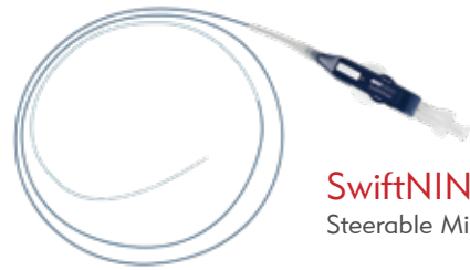
SwiftNINJA® Steerable Microcatheter