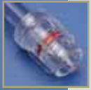
1200 PSI (83 Bar) Braided Tubing